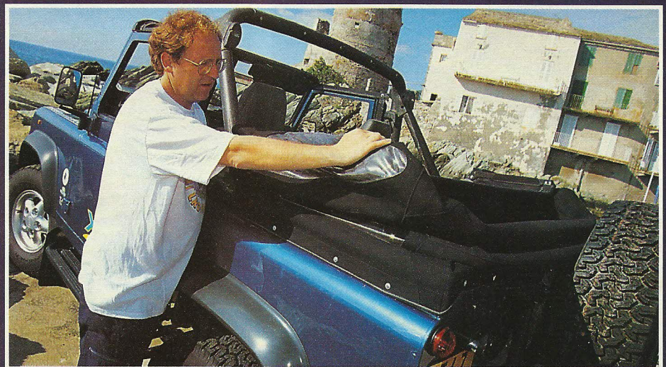
Hood folds back neatly and flat but rear bench room is lost