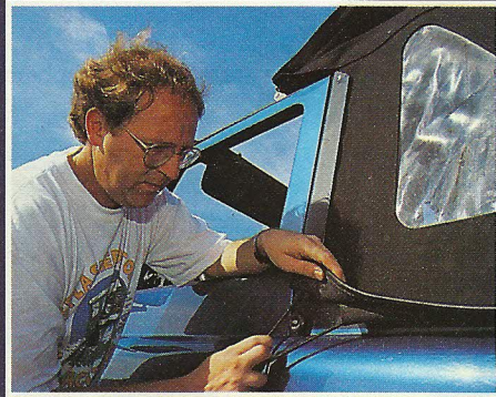
Unclip tie cord on flanks