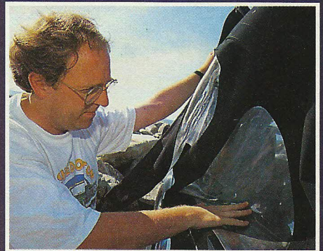
Care needed with plastic rear windows