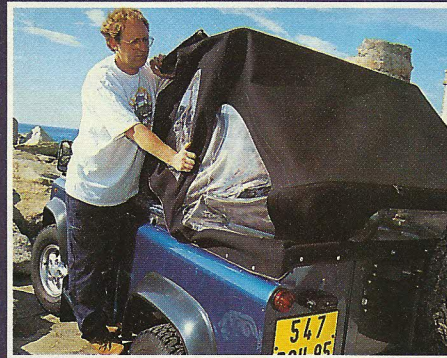
...to do the job single-handed